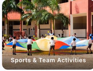
Sports & Team Activities